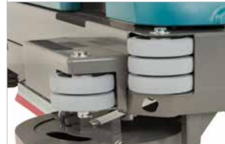
Heavy-duty Frame and Cushioned Corner Rollers

Overhead guard protects operators from falling objects.