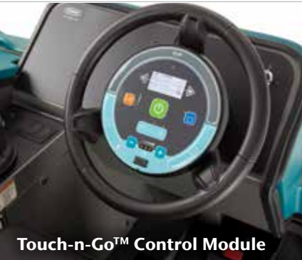
Touch-n-Go™ Control Module