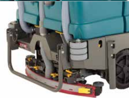
Dura-Track™ Parabolic Squeegee